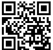
Giving Page QR Code