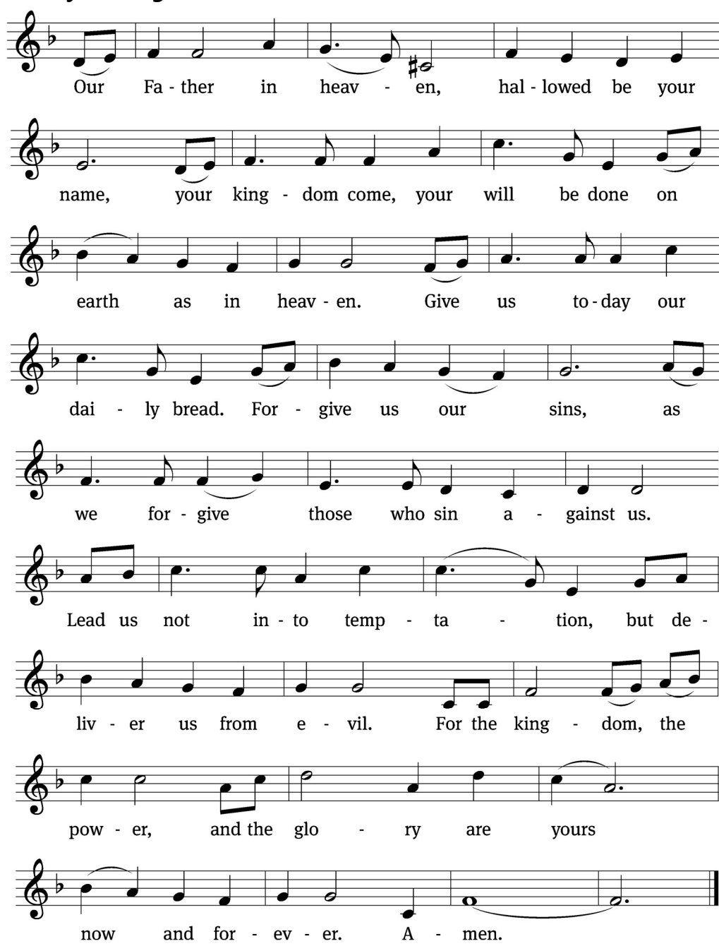
Tune: © 2002 Northwestern Publishing House. Used by permission: OneLicense no. 713891